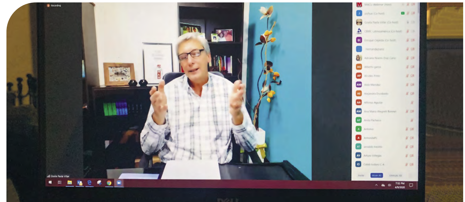
PHOTO: This spring, TSIS put on a free webinar series in Spanish. More than six thousand individuals viewed the bi-weekly series from 21 different countries.

"We are facing the unknown in many ways, but we do know that God is the same today, yesterday and forever; he doesn't change. I invite all our MACU family, friends and supporters to keep trusting God. He's always been faithful and He always will."