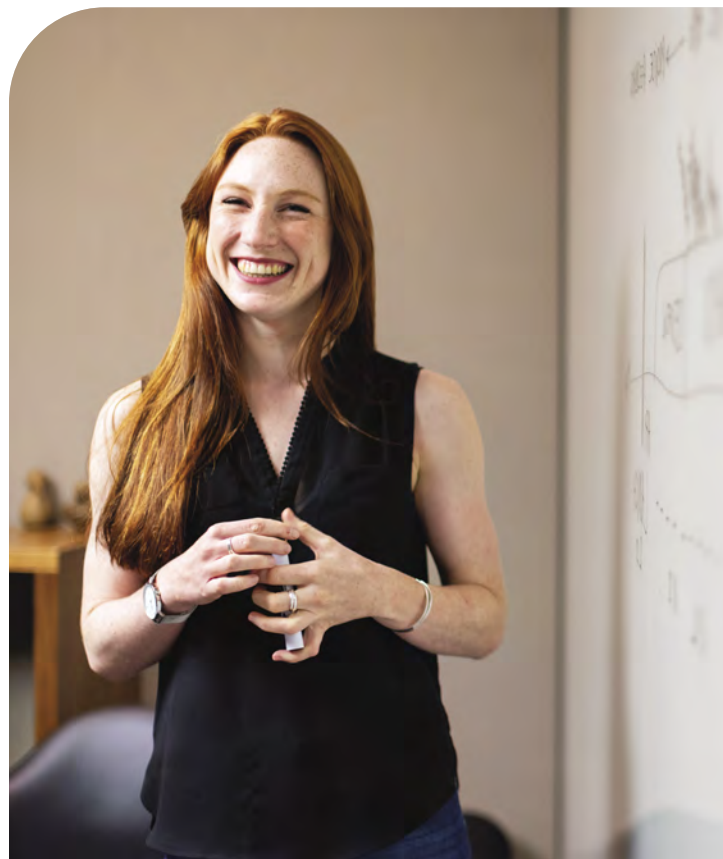
PHOTO: MACU is helping teaching assistants transition into emergency certified teachers through two new unique programs.

OSDE defines public school paraprofessionals as "an employee of a school district whose position is either instructional in nature, or who delivers other direct services to students and/or their parents. A paraprofessional serves in a position for which a teacher or another professional has the ultimate responsibility for the design, implementation, and evaluation of the individual educational programs or related services and student performance."