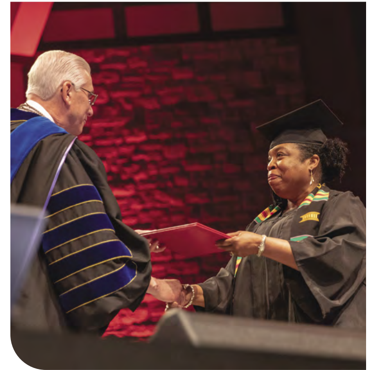
PHOTO: One of MACU's new options for teacher certification allows paraprofessionals to earn their bachelor's degree while meeting the requirements for Elementary or Early Childhood Alternative Education Certification.