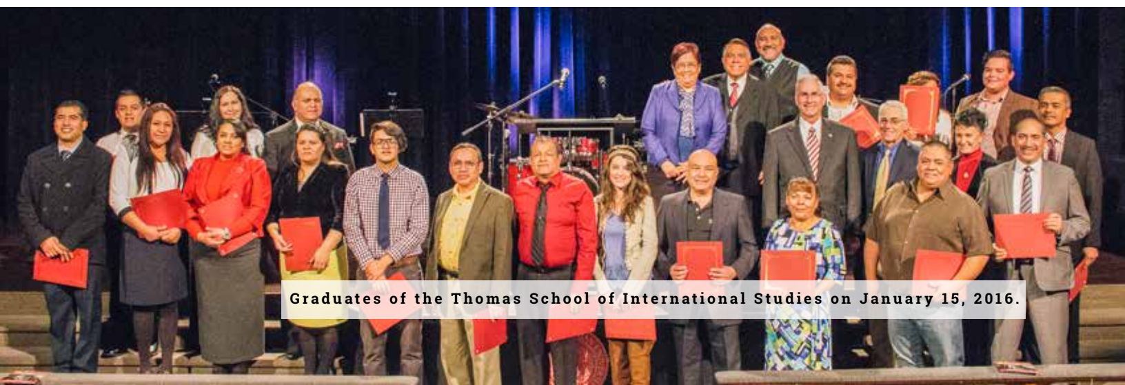
Graduates of the Thomas School of International Studies on January 15, 2016.

For more information, please visit www.macu.edu/tsis/