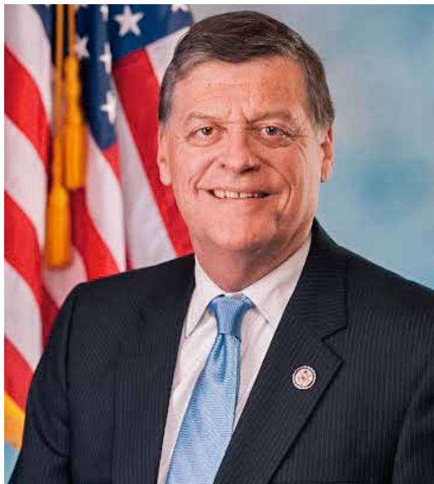
Congressman Tom Cole

To learn more about the gala and purchase tickets, visit dreamgala.macu.edu or contact the Office of University Advancement advancement@macu.edu or (405) 692-3191.