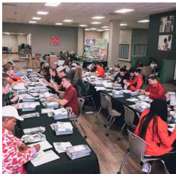
Students, faculty and staff assemble child sponsorship packets

"The students who assembled child sponsorship packets are making it possible for those children to gain access to nutritional meals, safe drinking water, educational support and community development initiatives. The students who volunteered at the Feed the Children distribution center helped to provide much needed food and essentials to families throughout the Midwest."