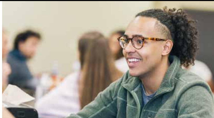
AUG 19 TRADITIONAL FALL CLASSES BEGIN