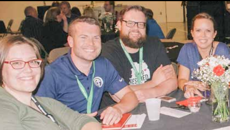
JUN 28 ALUMNI & FRIENDS RECEPTION