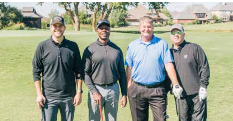
OCT 9 GOLF CLASSIC