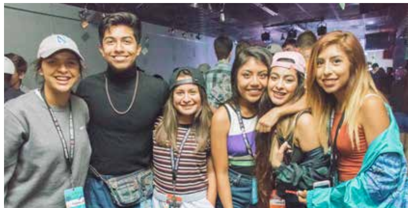
OCT 10-12 MACU MASH