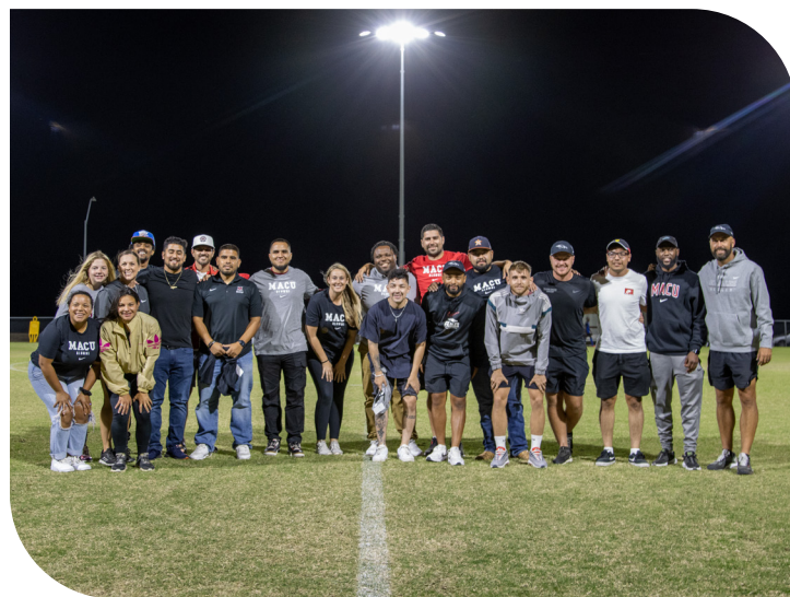
Men's and Women's Soccer Alumni came out to support our Evangel soccer teams in October