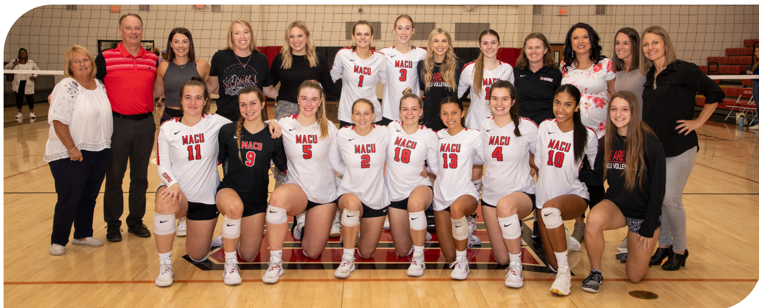
2001 National Championship Volleyball team being recognized at a volleyball game